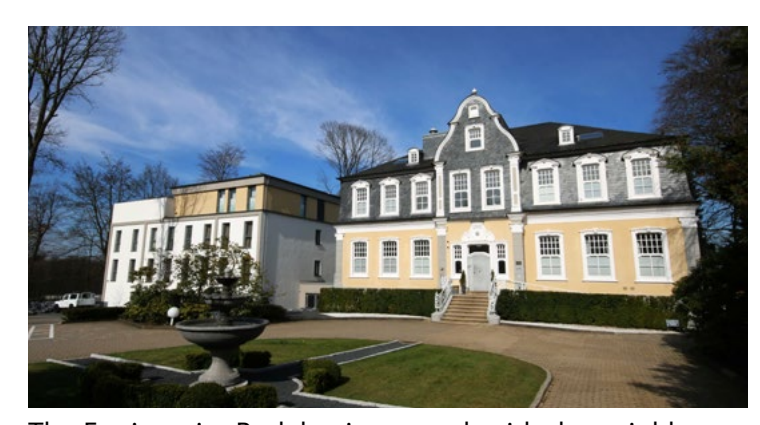
The EngineeringPark business park with the neighbouring four-star 'Park Villa' hotel.