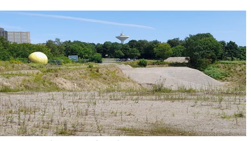
The property from the west.