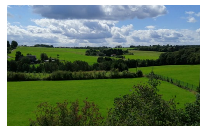
This could be the view from your new office.